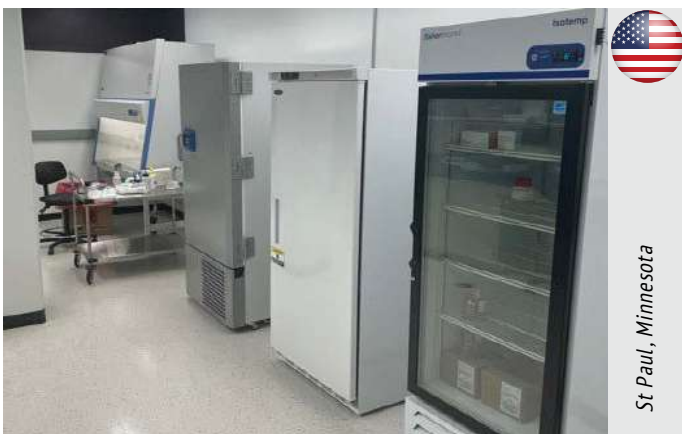
St. Paul, Minnesota