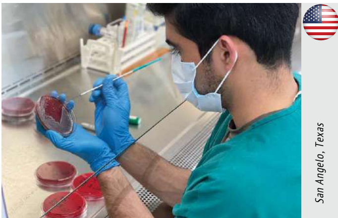
San Angelo, Texas